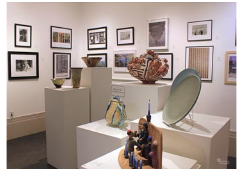
View of the "Student Show"