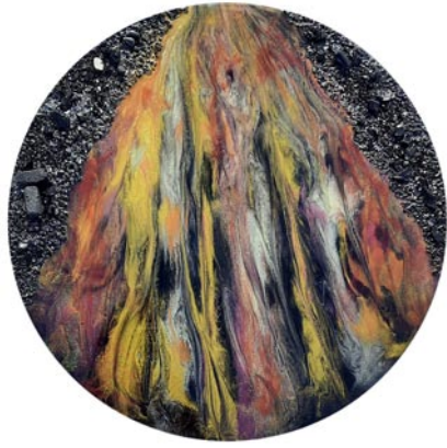
Work by Robyn Crawford

For further information check our SC Institutional Gallery listings or visit ( artistscollectivespartanburg.org ).