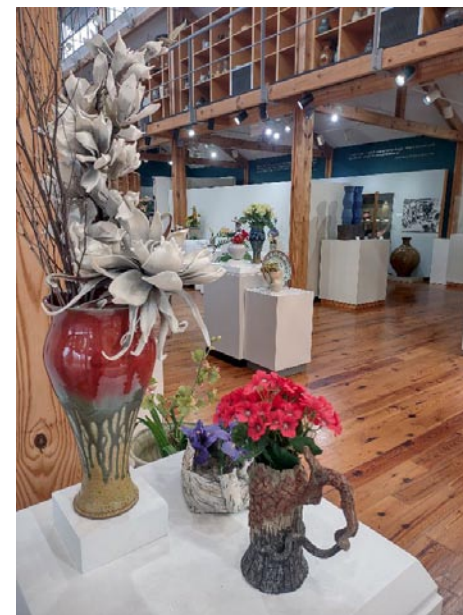
View of the exhibition

outdoors. There are currently 19 sculptures installed around the pond. The landscaped and natural areas have a focus on NC native plants and trees. As an extension of this park, a sculpture is installed in the downtown area of Seagrove. Hours: Mon.-Fri., 8:30am-4pm. Contact: 336/873-8291 or at ( www.cbssculpturegarden.com ).