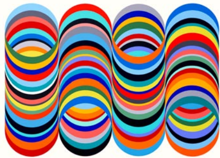
Work by Angela Johal

Bella Vista Art Gallery , 14 Lodge St., Historic Biltmore Village, Asheville. Ongoing - Featuring works by regional and national artists in a variety of mediums. Offering contemporary oil paintings, blown glass, pottery, black & white photography, stoneware sculptures, and jewelry. Hours: Mon.-Sat., 10am-6pm & Sun., 10am-4pm. Contact: 828/768-0246 or at (www.BellaVistaArt.com).