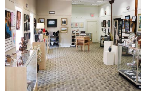
View inside the gallery

Trade Alley Art Gallery , 25 2ND ST.NW, Hickory. Ongoing - Trade Alley Art Gallery is a contemporary art gallery located in the heart of historic downtown Hickory. The gallery represents up to 25 artists of all genres. In addition there are artists on consignment representing wildlife wood carvings, fine furnishings and fine jewelry. Hours: Tue.-Sat., 10am-5pm, Contact: 828/578-1706 or at ( www.tradealleyart.com ).