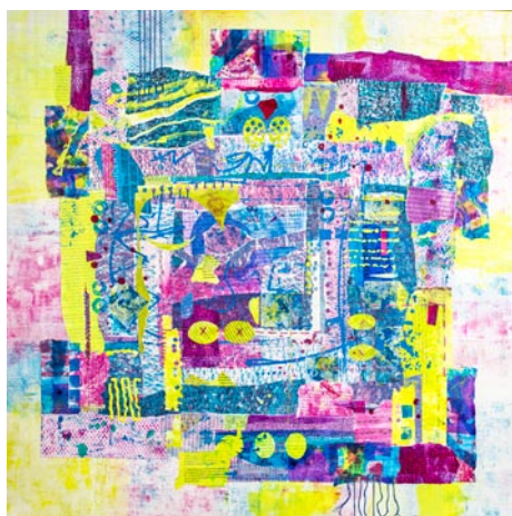
Work by Donna Varner

This spring, the group will stage an exhibit at the USCB Center for the Arts on Carteret Street in Beaufort. By focusing on art's formal elements, each artist uses line, color, form, texture, shape, value, and movement to create their individual works.