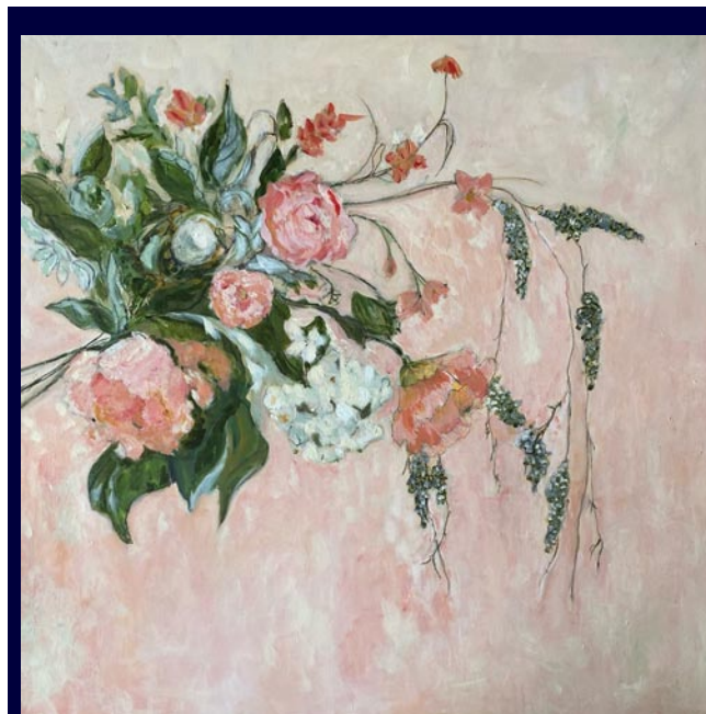
Flower Dreams, acrylic on canvas, 36 x 36 inches

For further information check our SC Commercial Gallery listings or visit ( www.artandlightgallery.com ).