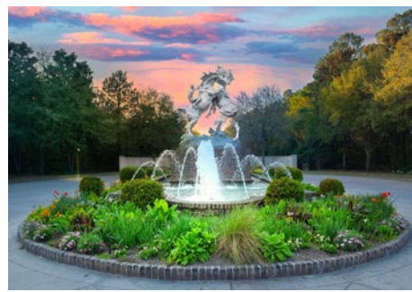
View of entrance into Brookgreen Gardens