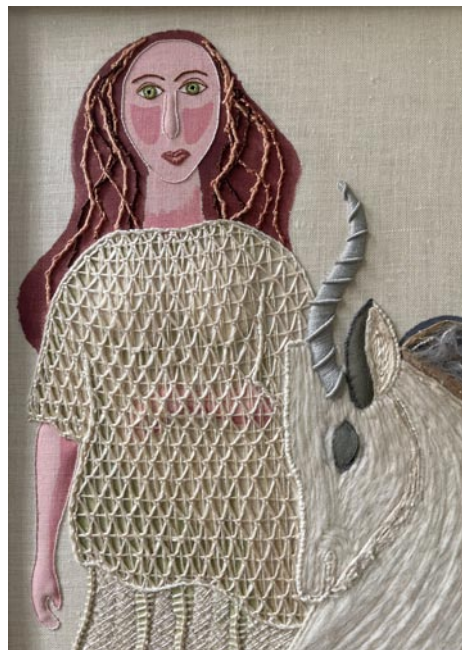
"Self Portrait" by Susan Livingston

Cecil Williams Civil Rights Museum , 1865 Lake Drive, Orangeburg. Ongoing - Established in 2019, the exquisite ultra-modern facility displays 1000 images of the Civil Rights Movement, but from the perspective of The Epochal South Carolina Events That Changed America. The massive archives comprise the largest collection of images of this type among all museums in the United States; including the Atlanta based High Museum which archives 300 images. The images were created by the founder, Cecil Williams, who began photography at age 9 and covered almost all historically significant events in South Carolina; from 1950 Briggs v. Elliot in Summerton, thru the 1969 Charleston Hospital Workers' Strike...and Beyond. From 1955 through 1969, Williams was a freelance journalist for "JET" magazine. His images have appeared in thousands of magazines, newspapers, historical publications, and motion picture productions. The museum design itself is part of the founders' DNA because; upon graduating from high school, Williams wanted to attend Clemson University to study architecture but denied because of his race. He then purchased a drafting board and through the years, designed three residences; including one featured in "EBONY", and the museum's design which has evolved into a living history facility. Hours: call ahead for hours. Contact: call 803-531-1662 or at ( www.cecilwilliams.com ).