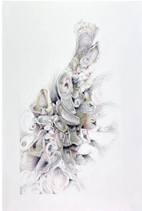
Work by Yvette Dede

Park Circle Gallery , formerly the Olde Village Community Building, 4820 Jenkins Avenue, in the bustling Park Circle neighborhood of North Charleston. Apr. 3 - 27 - "Air ~2," featuring mixed media works by Lynne Riding. A recep-