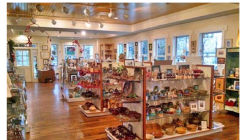
View inside SC Artisan Center

SC Artisans Center , 334 Wichman Street, 2 miles off I95, exits 53 or 57, Walterboro. Ongoing - Featuring work of over 300 of the SC's leading artists. The Center offers educational and interpretive displays of Southern folklife. Its mission is to enhance the appreciation and understanding of the rich cultural heritage of South Carolina. Hours: Mon.-Sat., 9am-5pm. Contact: 843/549-0011 or at ( http://www.scartisanscenter.com/ ).