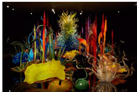
Chihuly at Biltmore

YMI Gallery , YMI Cultural Center, 39 S. Market Street @ Eagle Street, Asheville. Ongoing - "In the Spirit of Africa". Featuring traditional and contemporary African masks, figurative woodcarvings, beadwork, jewelry, and textiles. Discover the purpose of mask and sculptures, which reflect African ancestral heritage and learn to appreciate symbolism and abstraction in African art. YMI Conference Room, Ongoing - "Forebears & Trailblazers: Asheville's African American Leaders, 1800s –1900s". The permanent exhibit offers a pictorial history of African-Americans from throughout Western North Carolina. Photographs of both influential and everyday people create a panorama of the variety of life among blacks in the mountain region. Here are the young and old, the prominent and the unknown, the men and women who helped create our city's life. YMI Drugstore Gallery, Ongoing - "Mirrors of Hope and Dignity". A moving and powerful collection of drawings by the renowned African-American artist Charles W. White. Entry, Ongoing - "George Vanderbilt's Young Men's Institute, 1892-Present". Admission: Yes. Hours: Tue.-Fri., 10am-5pm. Contact: 828/252-4614.