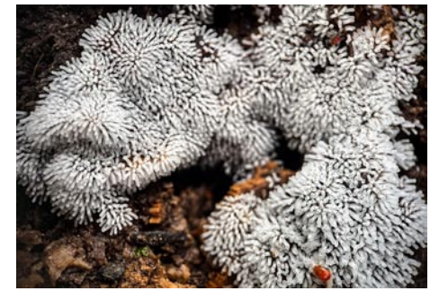
Work by Jax Gaglianese-Woody

King Street Art Collective , Watauga Ars Council, 585 West King Street, (above Doe Ridge Pottery) Boone. Ongoing - A gallery and interactive art space with changing exhibits and activities celebrating the arts. Hours: Thur., 11am-5pm; Fri.-Sat., 10am-6pm; and Sun., 10am-2pm. Contact: 828-264-1789 or at ( https://www.watauga-arts.org/kingstreetart.html#/ ).