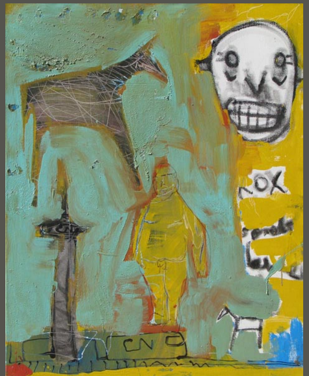
XONON Oil on Canvas 31 x 36 inches Casey McGlynn