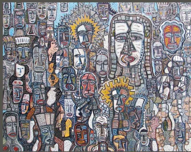
Zombies Oil on Canvas 20 x 16 inches Jan Boyer

EyeLevel Art and Artistic Spirit Gallery, in Charleston, SC, are collaborating on this Visionary art show offering the chance to collect “Outsider Art*” from nationally known artists.