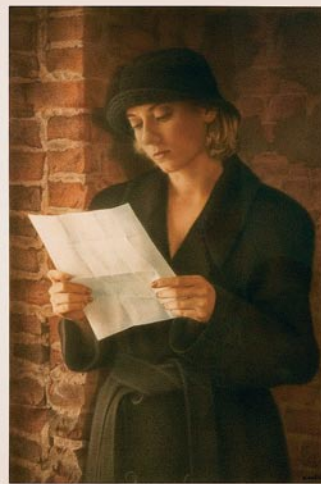
Best of Show 2010