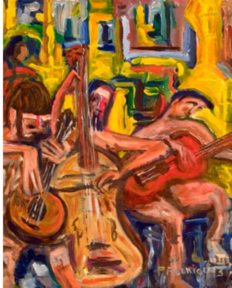
Work by Pedro Rodriguez

Center in Walterboro, SC. The exhibit is on view: May 1, 9am-5pm; May 2-6, 9am-5pm; and May 7, 9am-noon.