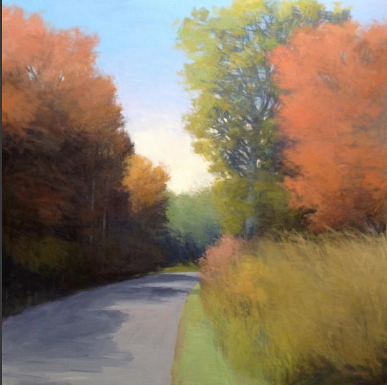
The Seasons are Changing 48" x 48"