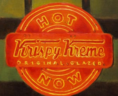
Hot Now, 12" x 12" oil on canvas, Isabel Forbes

New Works by Isabel Forbes & Paula Holtzclaw On Display May 1st - 31st, 2012 WWW.PROVIDENCEGALLERY.NET