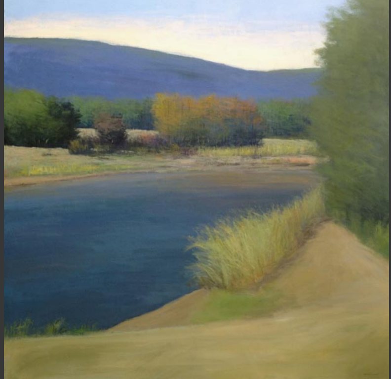
Across the Blue 48" x 48"