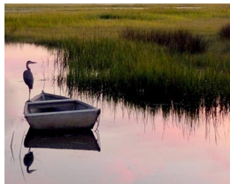
Work by John Parsons

The show will feature over 100 photographs, both digital and film, taken by Camera Club members. Many of these photographs will be available for sale, as well as matted images and note cards in the gift shop at the Museum.