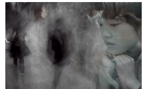
Work by Barbara Tyroler

transformation, synthesizing the ancient with the contemporary, the literal with the metaphoric. The show includes 23 large works, including ten new images produced specifically for this show, along with a silk installation made in collaboration with local fiber artist, Peg Gignoux.