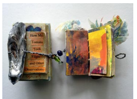
Work by Kit Loney

The artists involved work in a variety of media, including ceramics, drawing, painting, mixed media, and printmaking. Their works range from collaborative sketchbooks, handmade journals with ceramic covers, and hand-bound volumes of poetry, to art objects with book-like qualities. Some books have developed over time, or as part of large-scale proj-