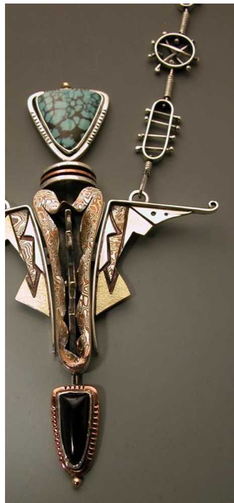
Work by Obayana Ajanaku

For further information check our SC Institutional Gallery listings or visit ( www.finecraftshowscharleston.com ).