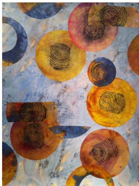
Work by Fritzi Huber

Both artists draw inspiration from nature, yet present more than one way of perceiving an image, offering their own distinctive interpretations. To each the process of examination and observation is a very integral part of the creative endeavor, with multiple layers of information added and subtracted before the finished work is complete. This is where the beauty and wonder of discovery takes place and the artist's vision takes hold.