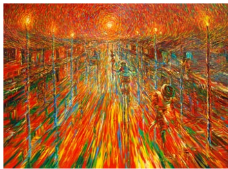
Work by Lorez (Nelo) Arquimides