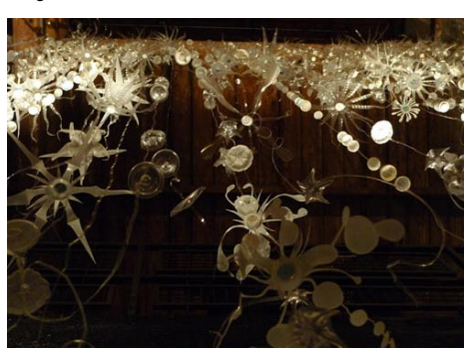
Work by Aurora Robson

Aurora Robson: Stayin' Alive is the artist's first major solo exhibition in the Southeast. Featured will be new suspended and wall-mounted works and a site-specific installation assembled from plastic debris. The exhibition's title references a wideawake vigilance, whimsically asking us to consider what exactly staying alive on earth entails? Consider the unnerving fact that all the plastic ever produced still exists and will remain on earth long after we are gone: