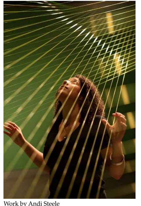
Work by Andi Steele

Kyle Worthy is an abstract landscape photographer living and working in Charlotte. The action of taking a photograph is