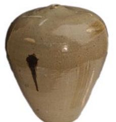
Renata Copeland, TR

Great doorprizes will be given away at various studio locations throughout the weekend!