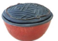
Phyllis Collins, PC