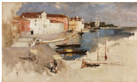
Frank Duvenek (1848 - 1919), Steps on the Riva , circa 1880, oil on canvas