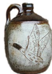
Pam Kadlec, PK