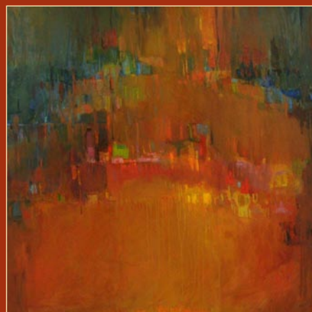
Where the Light Leads oil on canvas, 40" x 40"

www.LauraLiberatoreSzweda.net Contemporary Fine Art by appointment