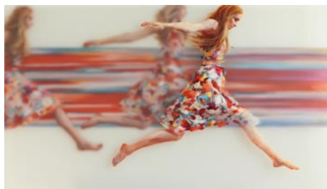
Work by Michelle Jader

"Inspiration struck after painting a series of studies on vellum-style mylar and stacking them on each other. The mylar's slight transparency combined with my expressive and slightly chaotic brushwork, allowed for a layered effect that seemed to vibrate with motion. This is when I realized that