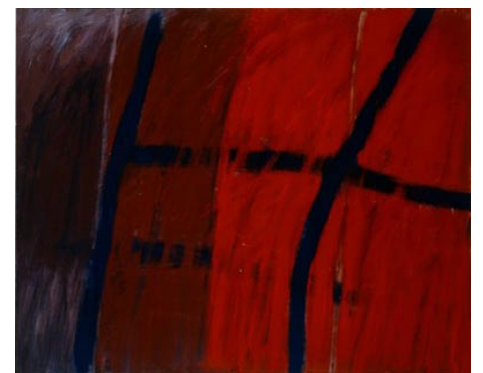
Jack Tworok "Barrier #5," oil on canvas, 64.5 x 80 inches. Estate of Jack Tworok, New York.

works from some of the participating artists. For further information call 704/837-1688 or visit ( www.lacaprojects.com ).