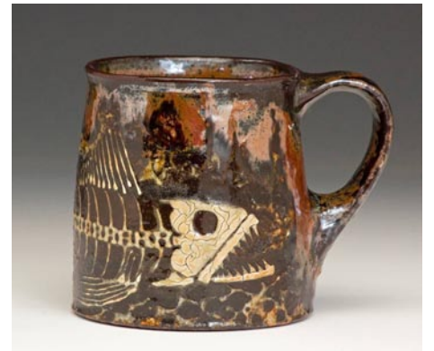
Work by Bruce Gholson

The North Carolina Pottery Center will open two new exhibitions May 30, 2015. "Prized Pieces: The Makers Collection" illustrates that makers tend to be collectors.