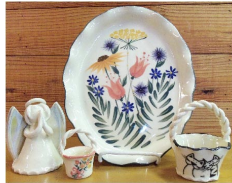
Works from Kovack Pottery

Kovack Pottery's spring event is May 23 - 31, 2015. The event will feature a large selection of hand-built, hand-turned, hand-painted, numbered, limited edition pieces. Each piece comes with a certificate of authenticity signed by both the potter and the artist who created it. The shop is open Mon.-Sat., 9am to 5pm and Sun., noon-5pm.