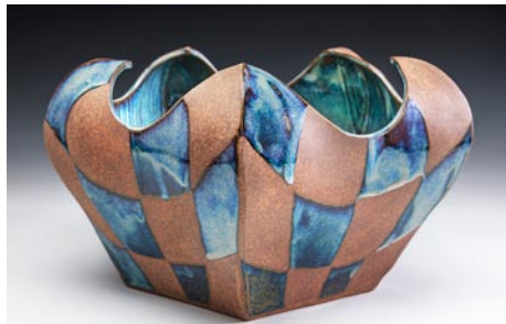
Work by Batton Clayworks

Commercial Gallery listings, call the gallery at 828/254-9234 or visit ( www.woolworthwalk.com ).