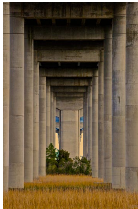
"A Holy Place" by Sandy Logan.

continued above on next column to the right