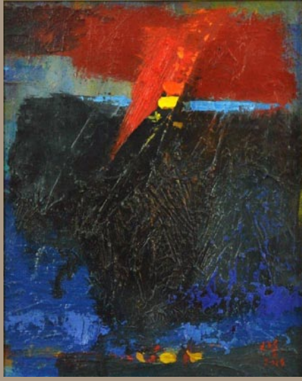
Thunderbolt oil on board 10" x 8"