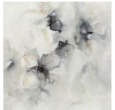
Work by Molly Courcelle

Molly Courcelle’s lush oils are more than just abstract paintings. One cannot help but try to imagine what the lovely organic forms are referencing but also to look deeper. The pieces are rich with layered paint and raw