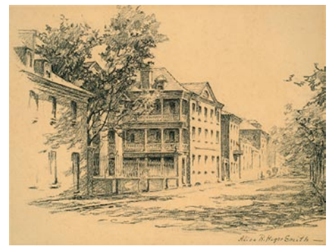
Caper-Huger Smith House: 69 Church Street from “The Dwelling Houses of Charleston”, c. 1917. Conté crayon and pencil on paperboard, 16 1/4 x 21 7/8 inches. Gibbes Museum of Art / Carolina Art Association, Charleston, SC.

Here's one tiny excerpt from the book on Charleston's little art community: “Tourism in Charleston began to expand during World War I when affluent visitors could not travel to Europe and instead looked to attractive stateside locals, and it became a booming local industry in the 1920s and 1930s. Tourist guides of the time indicate that an artist colony sprang into being in the neighborhood around Alice's studio. This confluence of creativity was all the