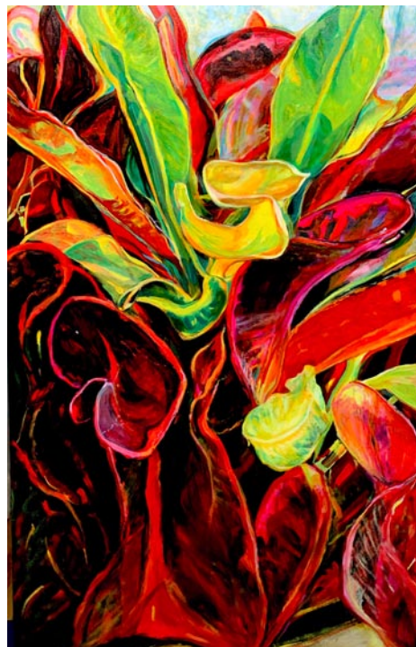
Work by Chuck Black

For further information check our SC Commercial Gallery listings, call the gallery