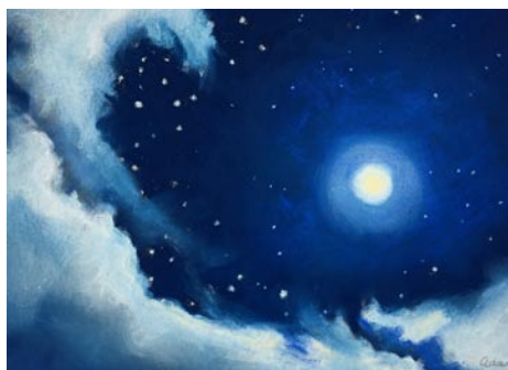
Work by Marion Adams

Marion Adams looks to the sky for inspiration. Working with pastels as her medium, she captures ethereal effects of the ever-changing scene overhead. Adams' intention is to capture the sky in its various moods, show the turbulence of clouds before a storm, haze drifting overhead on a moonlit night, and small points of starlight gradually appearing after sunset. The single acrylic painting, Wonder , stands alone among the pastels as a representation of her own quest seeking answers and, at times, the right questions.