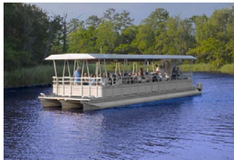
Brookgreen Gardens Boat Tours