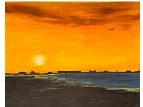
Work by Judy Martin

Throughout downtown Spartanburg's Cultural District, Ongoing - The Creative Crosswalk Project is a public art initiative in which local artists and designers design and paint a series of crosswalk murals, transforming the crosswalks into works of art, on Main Street in Spartanburg, SC. The downtown cultural district area is often bustling with events and pedestrians, and the pedestrians rely heavily on a multitude of crosswalks to safely traverse the downtown Spartanburg area. The problem is that crosswalks are incredibly easy to overlook, they are rarely visually appealing, and they can even be quite dangerous. In an effort to remedy these issues, Chapman Cultural Center, the City of Spartanburg, and the Spartanburg Area Chamber of Commerce came together to organize the Creative Crosswalk Project. For more info visit ( https://www.chapmanculturalcenter.org/pages/blog/detail/article/c0/a1555/ ).