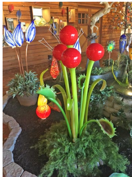
View inside One Eared Cow Glass

Noelle Brault Fine Art , 2305 Park Street, (historic Elmwood Park) Columbia. Ongoing - Noelle Brault is an impressionist artist who utilizes a unique blending of vibrant colors to capture the beautiful light and shadow found in South Carolina's Lowcountry and her native home of Columbia. Hours: by appt. only. Contact: 803/254-3284 or at (http://www.noellebrault.com).