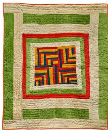
Nettie Young, "Untitled (Housetop)", 1970 (finished in 2003). Corduroy and synthetic material, 86 x 72 inches (218.4 x 182.9 cm). Collection of the Nasher Museum of Art at Duke University. Museum purchase, 2018.4.1. © Estate of Nettie Young / Licensed by Artists Rights Society (ARS), New York.

Room 100 Gallery , Golden Belt complex, Building 2, room 100, 807 East Main Street, Durham. Ongoing - The gallery is committed to promoting the work of emerging local, regional and national contemporary artists. Exhibitions of varying size and theme will be on view throughout the year with openings coinciding with Third Friday Durham. Hours: Mon.-Sat., 10am-7pm and Sun., noon-6pm. Contact: 919/967-7700 or at (www.goldenbeltarts.com).