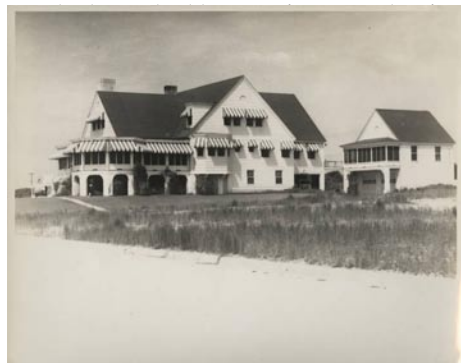
Photo of Cannon beach home, unknown photographer