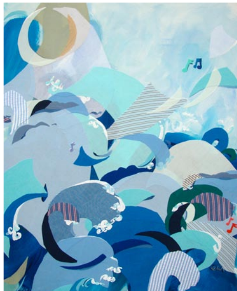
Work by Karin Olah

SCOOP Studios Contemporary Art Gallery in Charleston, SC, turns two in June with Antarctic: Revisited , the first group show featuring original works of art by each of the artists of SCOOP studios, on view from June 3 - 25, 2011. A reception will be held on June 3, from 5-8pm.