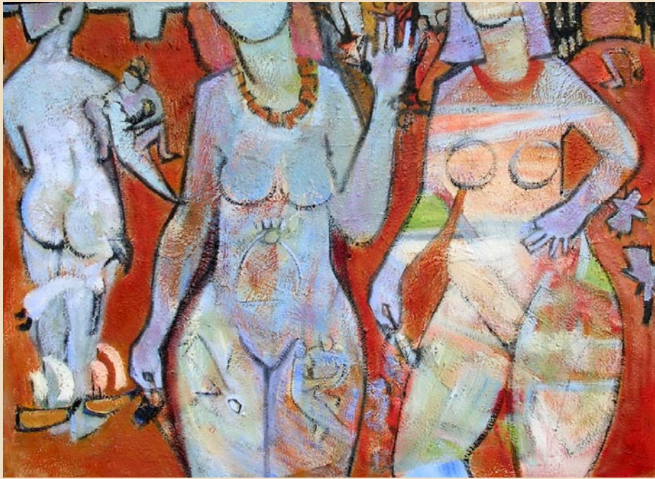
Judgement of Paris Oil on Panel 3 feet x 4 feet

“Mary Walker’s works might best be understood as Whimsical-Realism, an implementation of conservative portraiture extended beyond its usual bounds by imaginative flourishes reminiscent of Paul Klee and Wassily Kandinsky.”