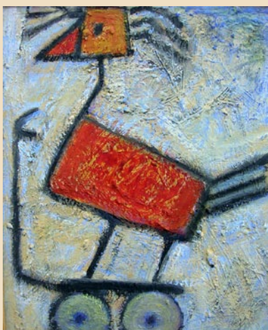
Firebird Oil on board 13 x 11 inches