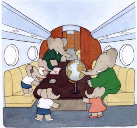
Work by Laurent de Brunhoff

The United States became familiar with King Babar and his Queen, Celeste, in 1933 and years later the world met their elephant children Pom, Alexander, Flora and baby Isabelle, as well as Babar's associates Cornelius and Zephir. Babar is characterized by the valuable lessons taught to his children and his seemingly human-like mannerisms.