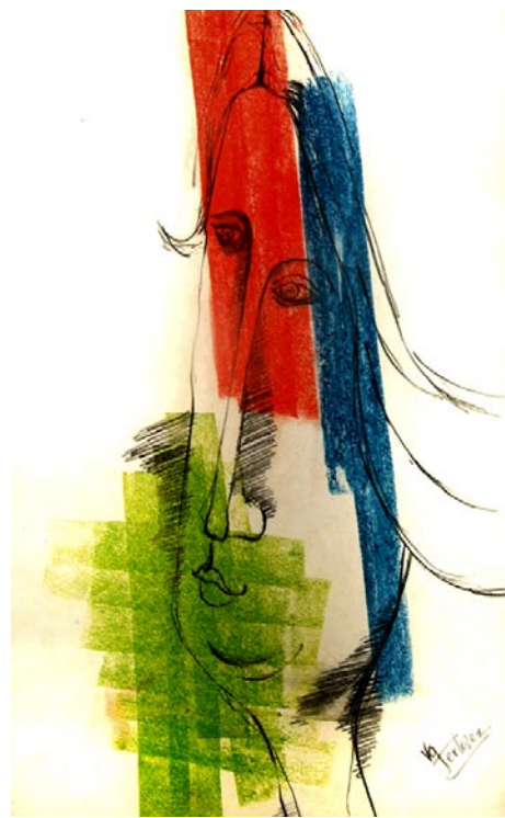
Work by Victor Gerloven

For further information check our NC Commercial Gallery listings, call the gallery at 910/575-5999 or visit ( www.sunsetrivermarketplace.com ).