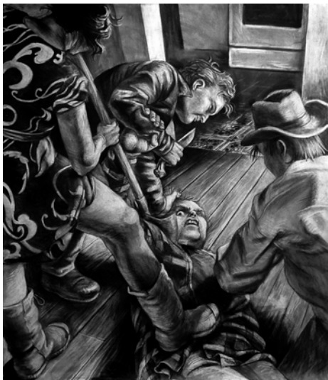
Work by Larkin Ford

Upstairs Artspace in Tryon, NC, will present the exhibit, Flood and The Pump: Galleries With Attitude , on view from June 3 through July 23, 2011.