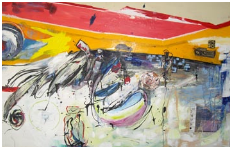
Work by Steven McCrea

The show will be an exciting survey of 2-D works created by professionals and amateurs alike with over 100 artists expected to be participating. With categories for children, novices, and professionals, the gallery is reaching out to those who create those intriguing marks on surfaces that engage the mind. Some do it through paintings on canvas, designs on the surface of wood, metal, paper, and fiber. The show includes traditional watercolors, oils, acrylics, ink, pencil, and mixed media, among others.