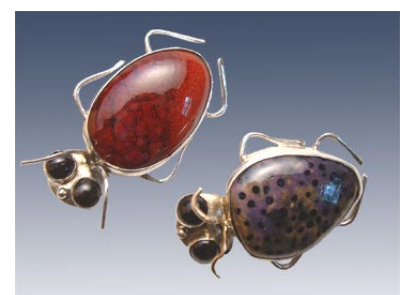
JLK Jewelry at Jugtown