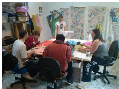
Working on Between the Lines exhibit