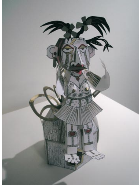
Work by Lillian Trettin

Included in this exhibit are handmade books, paper animations, miniature pictures of cut-paper collage, and jigsaw sculptures of wood and paper. The exhibit's purpose is to encourage viewers to reflect on the