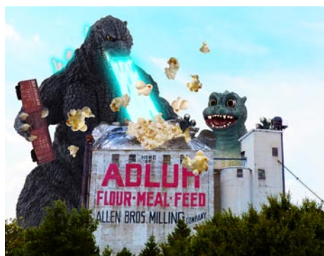
Work by Sean McGuinness

"The kaiju are just as much tools as acrylic paint, a carving knife, or sculpting clay. I take 60 plus years of kaiju history and bring the thunderous footsteps of