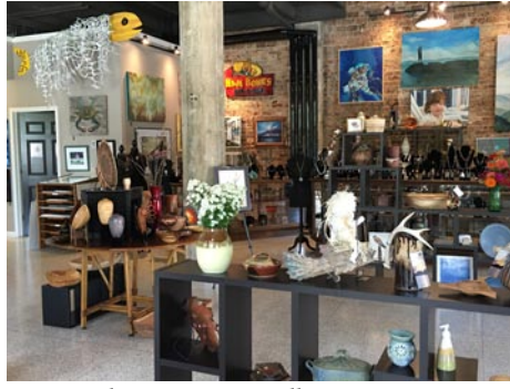
View inside Main & Maxwell