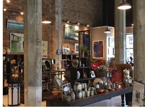
View inside Main & Maxwell