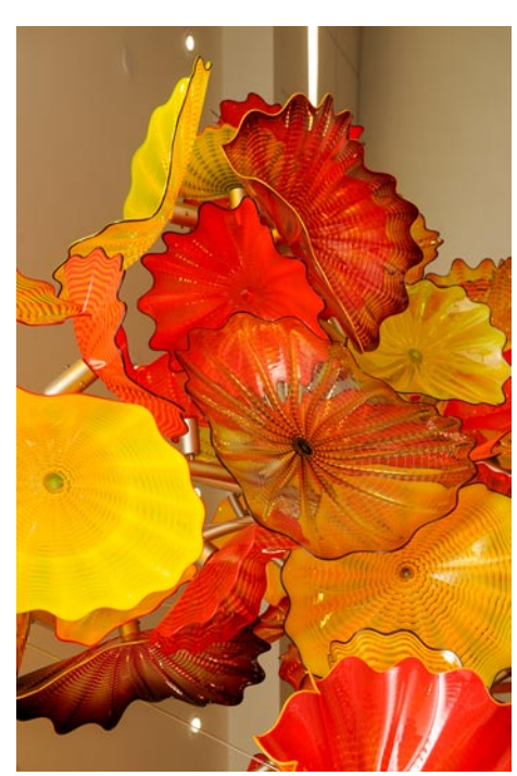
Detail of work by Dale Chihuly

the Richardson Family Art Museum and the Richardson Family Art Gallery, opened to the public on May 17.