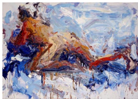
Work by Carl Plansky

"There's no doubt that Plansky's paintings and drawings are gender-based," says