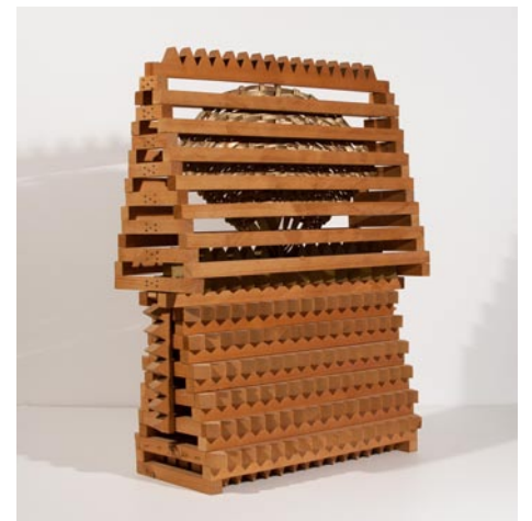
"Honey in the Hive", by Terry Jarrard-Dimond, mixed media sculpture, 1991, 24" x 18" x 7"

The artworks on exhibit will include early sculptural works which utilize found objects in conjunction with constructed