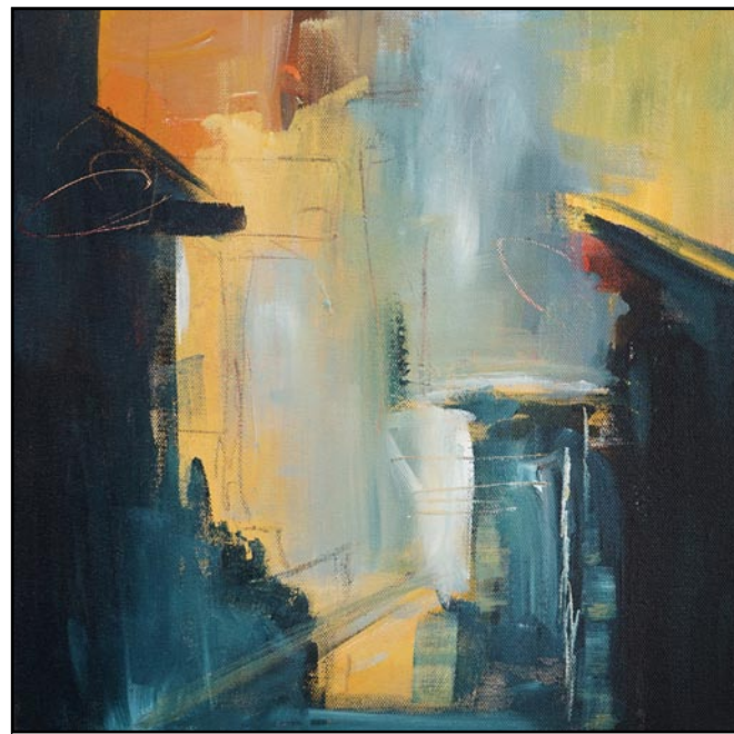
Ginny Lassiter, Stage Door , acrylic on board, 12" x 12"