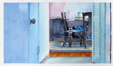
Work by Ambrin Ling

Utilizing wall texts and appropriated imagery from the 2016 film Moonlight , No Real Desire challenges perceptions of value, power, and centrality as they relate to what spaces are pictured and who is shown. In doing so, it asks us to question our desires as consumers of media-like images, objects, and the written word. Sometimes apparent absence is not a lack, but instead suggests resistance to fetishizing gazes and the fixation on the marginalized body of color; sometimes landscapes are not harmless and romantic nods to the past, but imply framing and controlling environmental forces and peoples. By moving through the languages of abstraction and representation, text and image, and contemporary and historical media appropriation, Ling folds