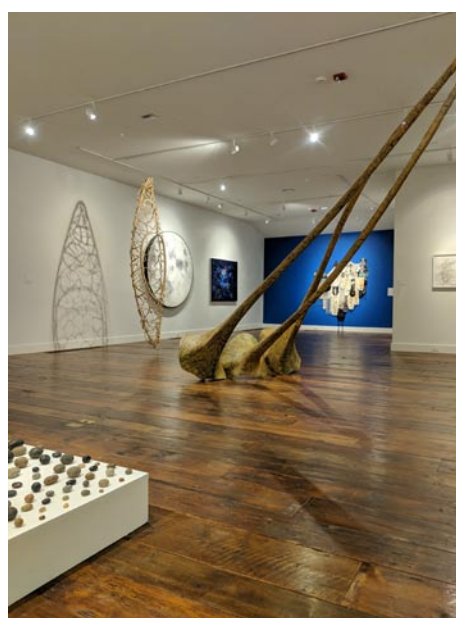
View inside the Bunzl Gallery