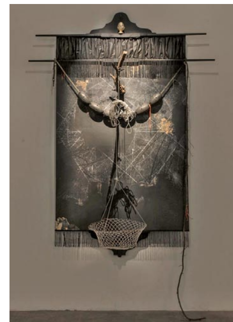
Work by Michi Meko

tion call the Center at 828/526-4949 or visit ( www.thebascom.org ).