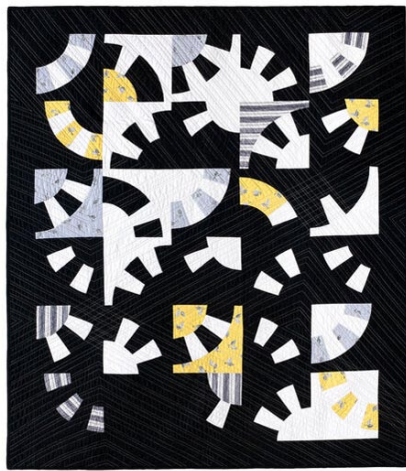
Work by Cheryl Brickey

The Modern Design Lab Quilt Invitational Exhibition is organized by the Modern Design Lab (MDL), who are a group of modern quilters based out of the greater Greenville area. The Modern Design Lab was formed when seven friends met through the Greenville quilting community and later convened to explore design, fabric and quilting techniques. The MDL now meets monthly to share individual projects, seek creative input and critique artworks. Each month the group participates in a design challenge or a creative workshop. They have also created group quilts, where each person creates individual quilt blocks and then the group collaborates to design a single finished quilt. Their latest exhibition was juried into QuiltCon held in Austin, TX, in February 2020.