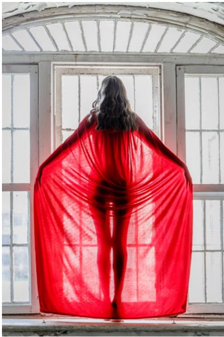
Work by Chuck Reback

continued from Page 15 / back to Page 15