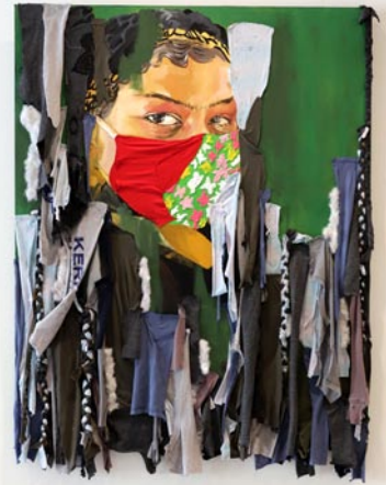
Work by Asia Spinks

Feeling famished, after roaming the realm, dish up a roaring good time with fyne Festival food! Eat your way through the village as endless concessionaires offer a wide assortment of confections, premium meats on sticks, stews, and much more! Try the King's hot roasted nuts. Wash it all down with a craft brew or Pepsi, whatever strange