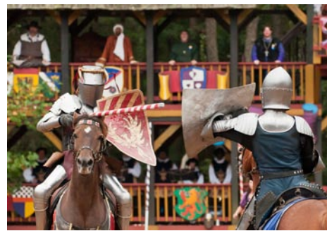
Real Live Jousting 3 Times a Day

Glass blowing, blacksmithing, cobblers, potters, candle makers, sculpting, leather work, jewelry and much more can be yours, if you have the coin. The open air Artisan Marketplace features over 140 vendors displaying a variety of unique, hand-made wares. It's a shopper's paradise! With the holiday season just around the corner, the village Artisan Marketplace is the destination for an endless array of unique, one-of-a-kind gifts!