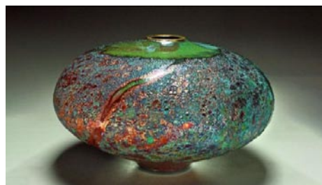
Work by Steven Fornes-deSoule

Seagrove Area Pottery Center (Not the NC Pottery Center) , 122 E. Main St., Seagrove. Ongoing - The former museum organization was founded twenty-five years ago in Seagrove, and is dedicated to preserving and perpetuating the pottery tradition. We strive to impart to new generations the history of traditional pottery and an appreciation for its simple and elegant beauty. A display of area pottery is now offered in the old Seagrove grocery building. Hours: Mon.-Sat., 9:30am-3:30pm. Contact: 336/873-7887.