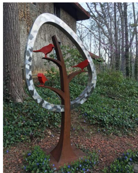
Work by Dale Rogers

Gallery of the Mountains , Inside The Omni Grove Park Inn, 290 Macon Ave., Asheville. Ongoing - Showcasing American handmade crafts by more than 100 artists and craftspeople from the Southern Appalachian region. Wed.-Sun., 10am-5pm. Contact: 828/254-2068.